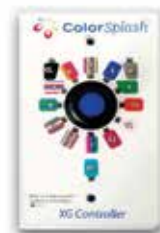
J&J's ColorSplash XG Controller Operates ColorSplash LXG-W Fixtures