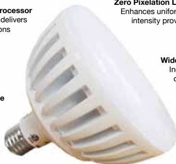
Shown: LXG-W Pool Lamp

High Output LEDs Optimizes color saturation and light intensity